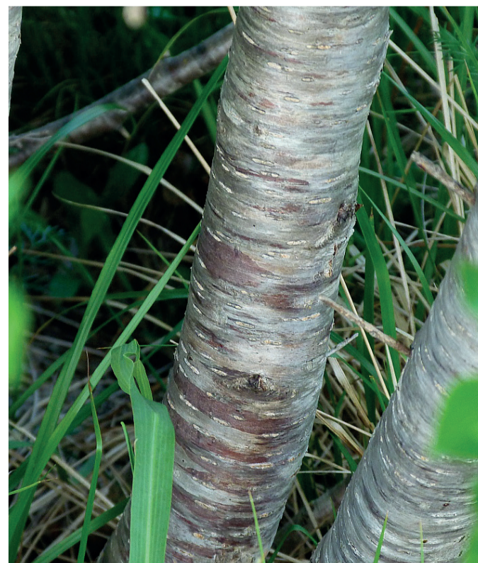
••• Bark is smooth grey-brown with horizontal strips that pull away.

This is an extended summary of the chapter. The full version of this chapter (revised and peer-reviewed) will be published online at https://w3id.org/mtv/FISE-Comm/v01/e016531 . The purpose of this summary is to provide an accessible dissemination of the related main topics.