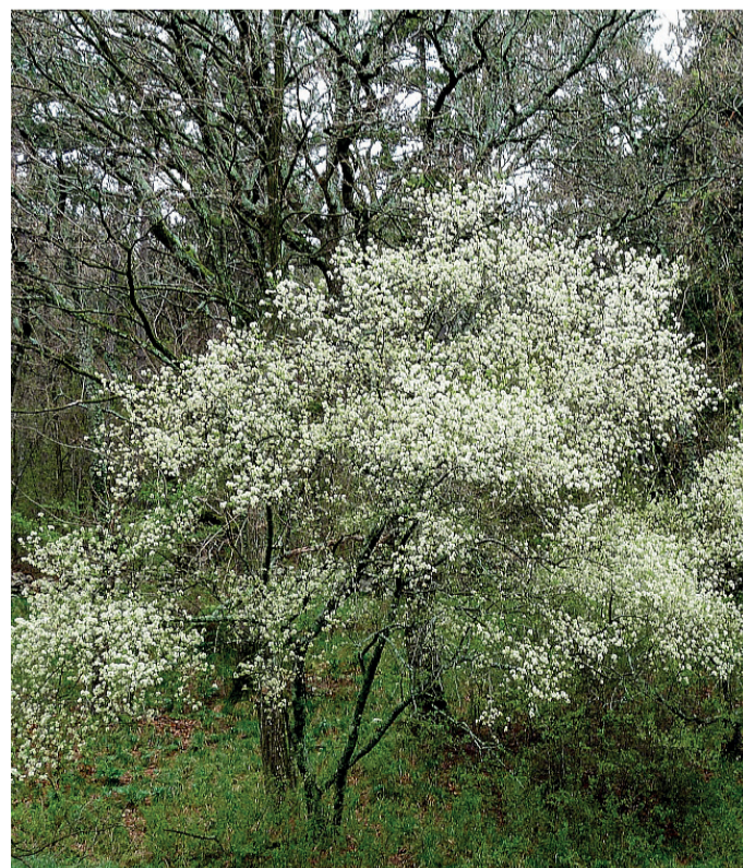
••• Flowering shrub in spring in a hedgerow near San Lorenzo (Trieste, North-West Italy).