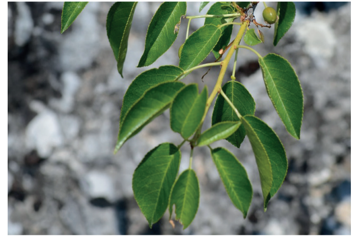
••• Ovate simple leaves with pointed tips and finely toothed margins.