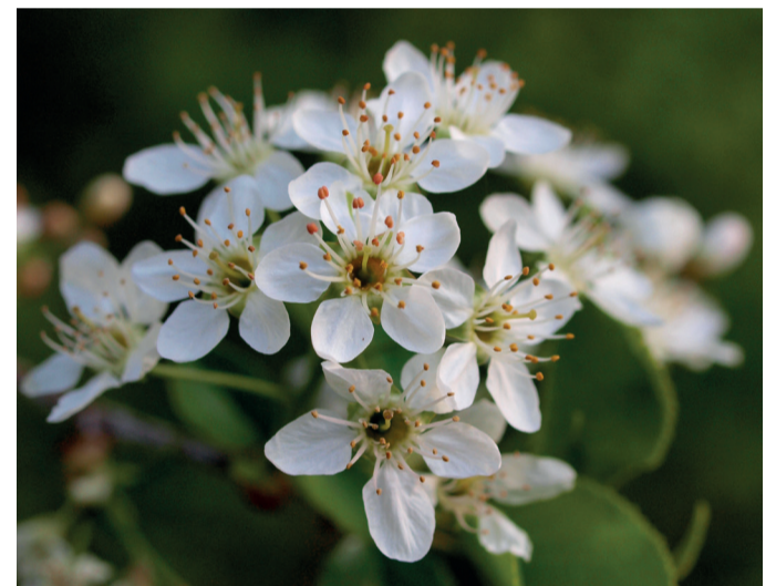
••• Hermaphrodite flowers arranged in corymbs with 5 white petals and 20 stamens.

The mahaleb cherry is susceptible to fungi such as bracket fungus ( Laetiporus sulphureus ) and witches' broom ( Taphrina cerasi ) on its trunk and branches. The rust fungus Tranzschelia discolor a relatively common parasite on its leaves, or Taphrina minor which causes shrinkage and reddish-brown discoloration of affected leaves, and Phloeosporrella padi causing leaf spots on infected leaves 5 .