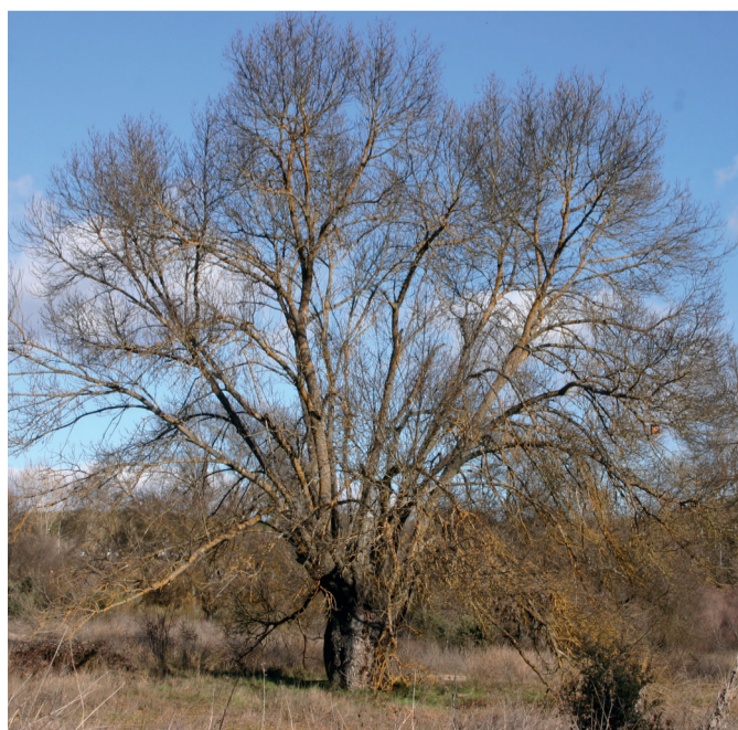
Isolated tree in the Spanish countryside during winter.

The wood of narrow-leaved ash has similar properties to the common ash, although the quality is inferior in terms of strength and elasticity 3 . Timber plantations are not very common over Europe, as it is mainly planted in combination with other species 14 . Higher wood quality, comparable to common ash, can be obtained on drier sites where tree growth is slower 3 . In the north-west of Turkey, where narrow-leaved ash is more used in fast-growing plantations on swampy lowlands, the wood quality is more similar to the poplars and is suitable for pulpwood and bonded wood products, such as plywood, laminated veneer lumber and glued laminated timber 15–17 . Leaves are palatable to livestock and in southern Europe this ash was traditionally used as a fodder tree. It is also widely used as an ornamental