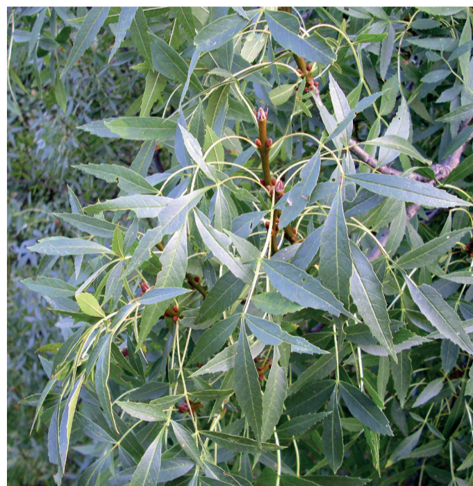
Shiny green composite leaves with 7–13 slender leaflets.

Its distribution covers the central-southern Europe and northwest Africa, up to the Caucasus 5, 6 . Due to its large morphological variations, this ash species includes a complex of taxa and its taxonomic status is still not clear. However, prevailing opinion recognises three geographical subspecies on the basis of molecular and morphological data: the narrow-leaved ash ( Fraxinus angustifolia subsp. angustifolia ) in south-western Europe and north-western Africa, the Caucasian ash ( Fraxinus angustifolia subsp. oxycarpa ) in central Europe, Balkans and the Black Sea region, and the Syrian ash ( Fraxinus angustifolia subsp. syriaca ) in south-east Anatolia, Middle East to Iran 7 . The northern part of the distribution overlaps with that of common ash ( Fraxinus excelsior ), with which it can naturally hybridise, developing plants with intermediate trait forms 8, 9 . Exported as an ornamental tree, this ash is naturalised in southern Australia 10 .