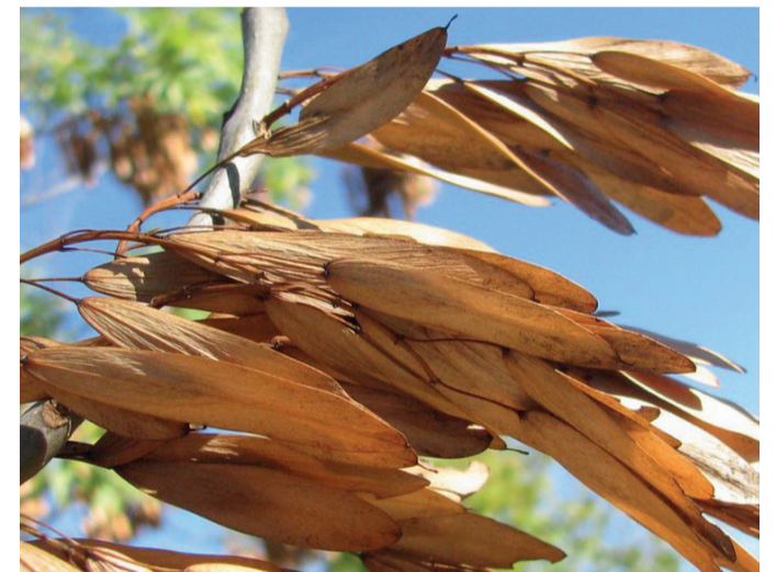
Mature dry samaras at the end of summer.

As is the common ash, the narrow-leaved ash is also susceptible to dieback caused by the fungus Chalara fraxinea , the anamorphic stage of Hymenoscyphus albidus , which has caused serious damage in nurseries and in lowland forest stands of central Europe 20–22 . This fungus is potentially subject to expansion in the European temperate oceanic ecological zones 22 . Infected trees show wilt of leaves, necrosis and cankers on shoots, branches and stems, followed by gradual dieback of the crowns 23, 24 . Like other tree species of floodplain and wetland forests, the narrow-leaved ash has seen reductions in its natural habitats and alterations of the forest dynamics due to the modifications of hydrologic regimes of the rivers 25, 26 . In Australia Fraxinus angustifolia is called desert ash and represents an invasive species in the southern States, where it can form dense monocultures in riparian areas and along drainage lines, spreading via suckers and preventing the regeneration of native species 27 .