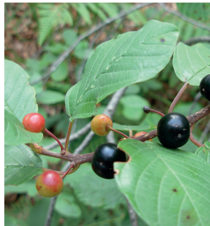
Violet black mature fruits: these fleshy drupes are principally dispersed by birds. (Copyright Roberta Alberti, www.actaplantarum.org: AP)

The alder buckthorn is generally free from any significant pests and disease 8 . It can be a host in the life cycle of the crown rust fungus ( Puccinia coronata ), which affects oat and barley 15,16 . In southern Spain relict populations of Frangula alnus subsp. baetica , which occur at the limits of geographic range for this species, are in decline and threatened by increasing summer droughts 17 . On the contrary, in North America this species is ranked as "highly invasive", due to its tendency to replace native plants, and several prevention and control programmes have been started where dominant alder buckthorn can negatively affect native species richness, simplify vegetation structure, disrupt food webs and delay succession 2,7 .