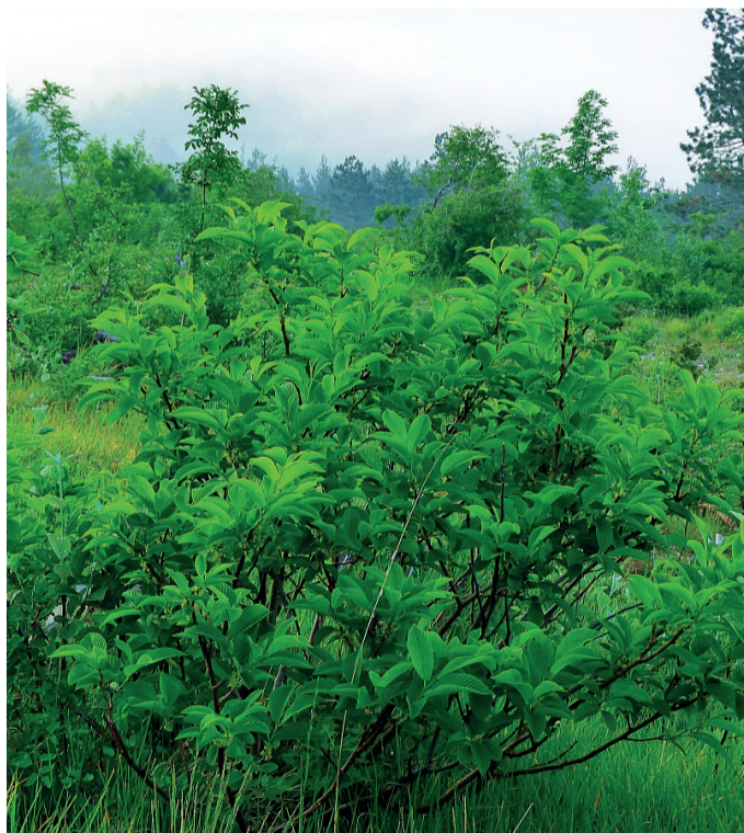
Young alder buckthorn in shrub form. This species rarely develops over 7 m in height.

Field data in Europe (including absences) ● Observed presences in Europe ●