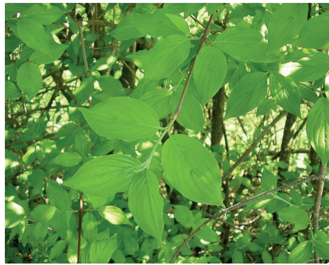
Oval leaves with entire margins and evident veins.

the fungus Colletotrichum acutatum observed in Iran<sup>27</sup>, or rots on young seedlings caused by the oomycete Phytophthora citricola in Bulgaria 28. The widespread use of cultivars vegetatively propagated and the deforestation of natural populations are increasing the attention on threats of genetic erosion. Mainly in the countries where the cornelian cherry covers an important economic role, new genetic protection programmes have been created for germplasm conservation 3, 17, 20, 29.