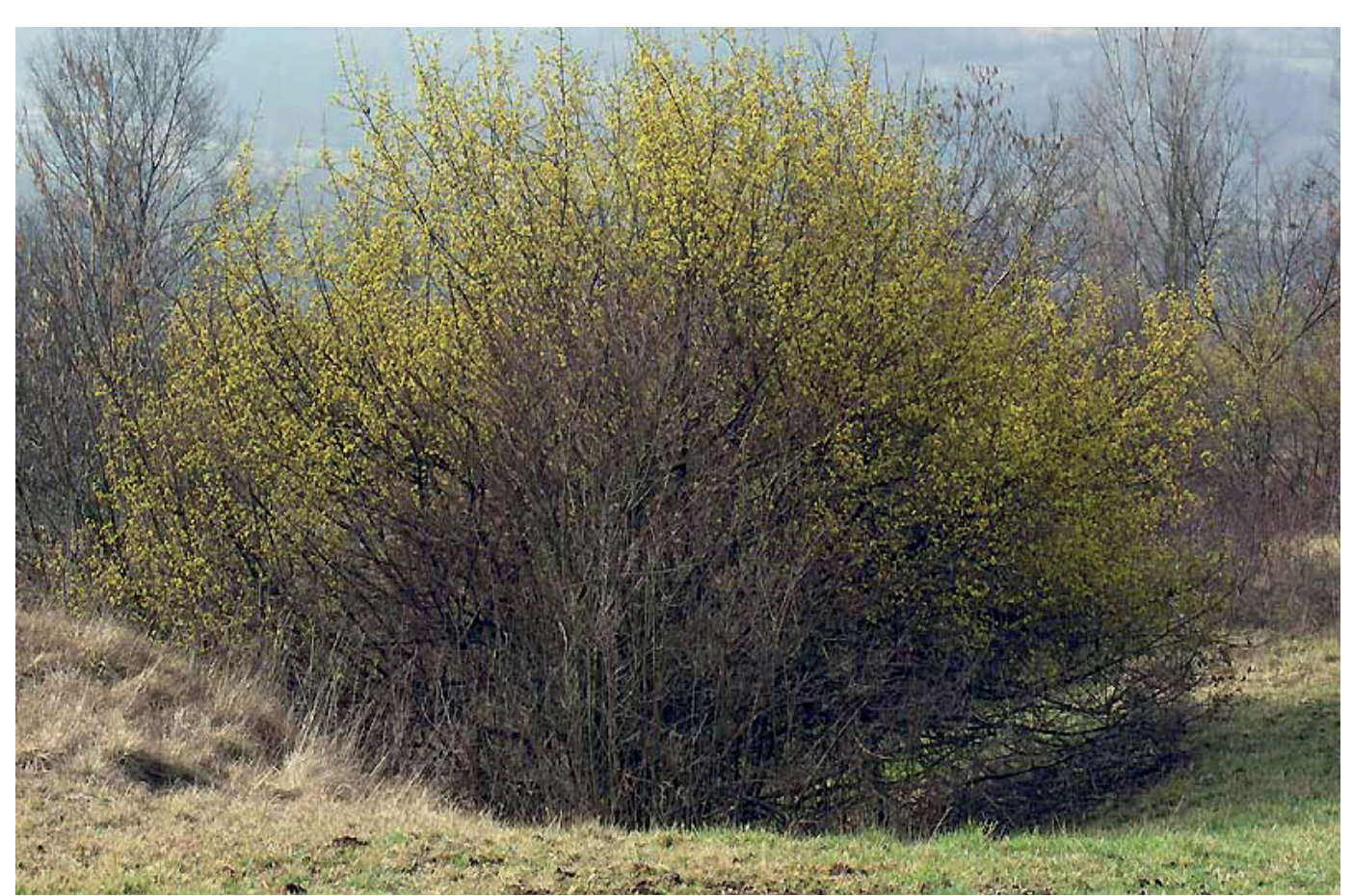
Shrub form of Cornelian cherry with yellow flowers blossoming before foliage develops in spring

The cornelian cherry has been apparently free of disease and pest problems, a highly appreciated characteristic which gained its use as an ornamental and orchard species. However, recently the first diseases have been reported, principally in nurseries and plantations, such as the leaf spot and fruit rot disease caused by