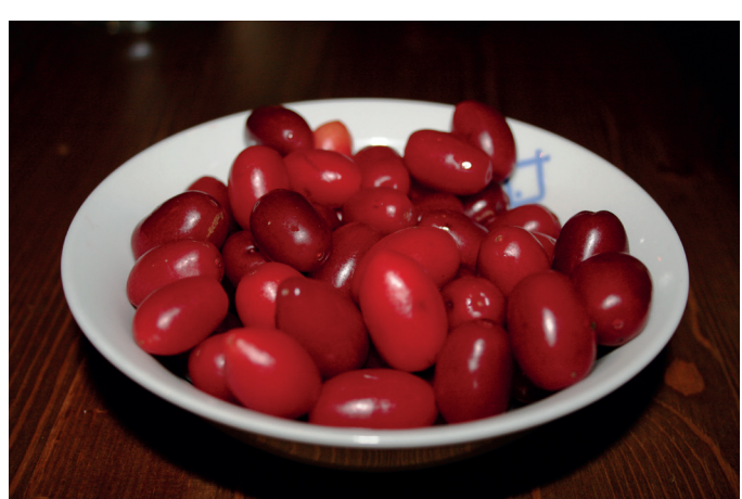
The fleshy fruits of Cornelian cherry are edible and used for a variey of culinary purposes.