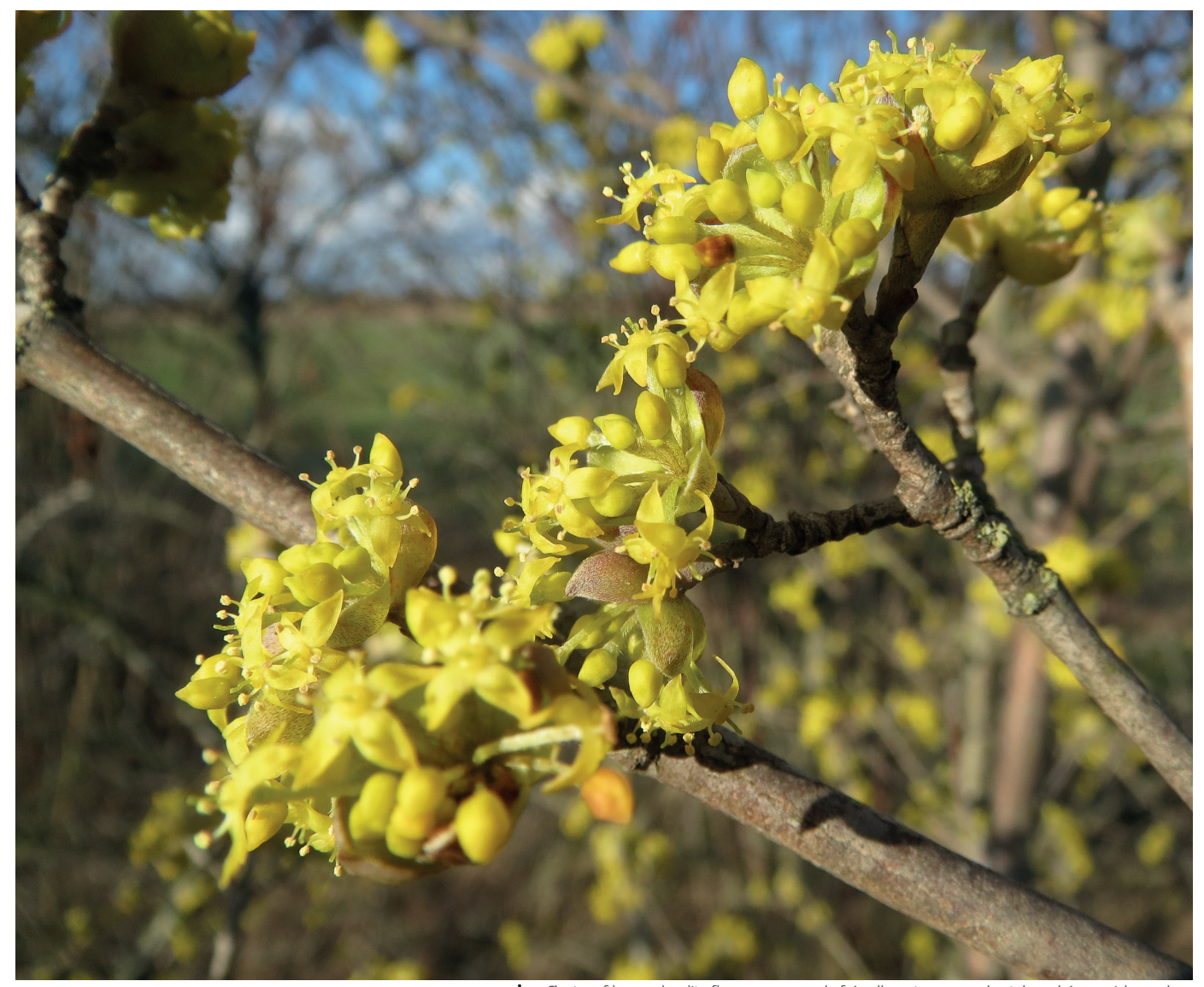
· · · Cluster of hermaphrodite flowers composed of 4 yellow stamens and petals and 4 greenish sepals.

For this purpose several cultivars have been selected, bearing fruits with different sizes, taste (acidity and sweet) and colours (from creamy white, yellow, orange, red, violet to black); e.g. the 'Macrocarpa' variety bears large and pear-shaped fruits, 'Alba' white fruits and 'Flava' yellow and sweeter fruits<sup>4</sup>. In Asia, Cornelian cherries are also made into an alcoholic beverage, similar to the 'Drenja' beverage produced in Serbia<sup>22</sup>. Fruits are rich in tannins and sugars as well as phenols, ascorbic acid, flavonoids and anthocyanins<sup>23, 24</sup>. Traditionally the fruits were used as a diuretic, analgesic and tonic. In Middle Age cornelian cherry shrubs were commonly planted in monastery gardens4. Recently its therapeutic properties have been well documented, finding high antioxidant and anti-inflammatory properties with beneficial effects on cardiovascular, endocrine, gastrointestinal and immune systems<sup>22, 24, 25</sup>. The abundance of flowers