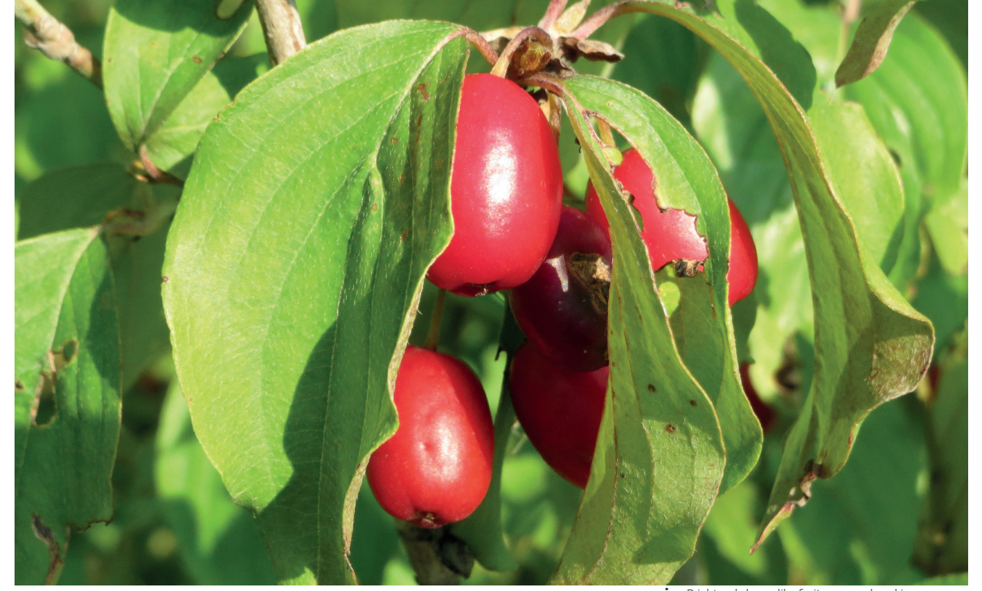
· · · Bright red cherry-like fruits are produced in summer