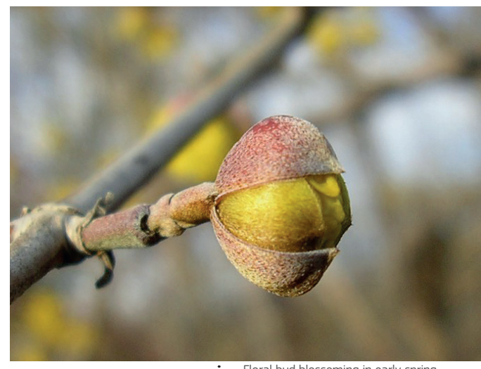
Floral bud blossoming in early spring. (Copyright Franco Rossi, www.actaplantarum.org; AP)