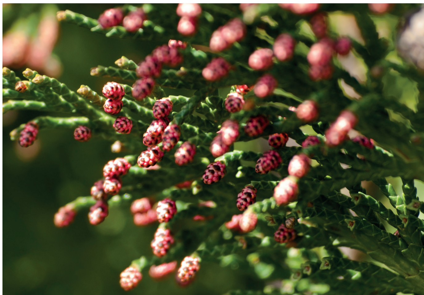
Immature cones developing at the ends of the shoots.