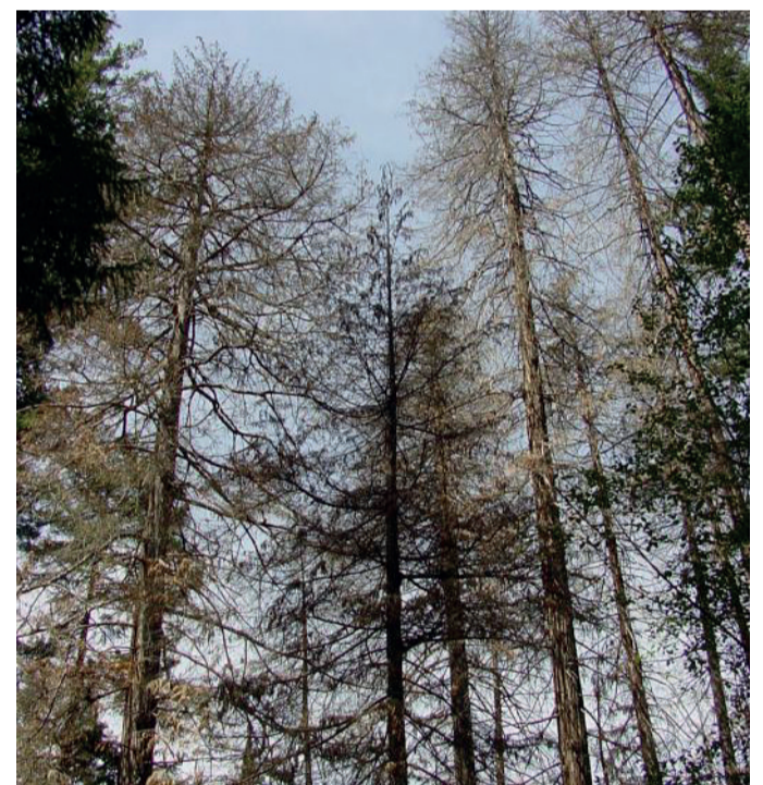
Lawson's Cypress killed by Phytophthora lateralis (Roseburg, Oregon).