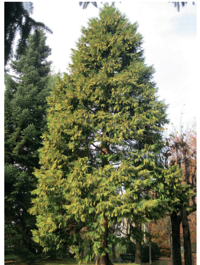
Ornamental specimen in a park in Varese (North Italy).

Lawson cypress is highly susceptible to the oomycete Phytophthora lateralis that has spread throughout much of its range, causing heavy losses since first being described in 1923 1 . The pathogen causes root rot and can quickly kill trees of all ages. This has resulted in Lawson cypress now being classed as “near threatened” in the United States. The pathogen has more recently been observed in Europe where it now poses an increasing threat 16, 17 .