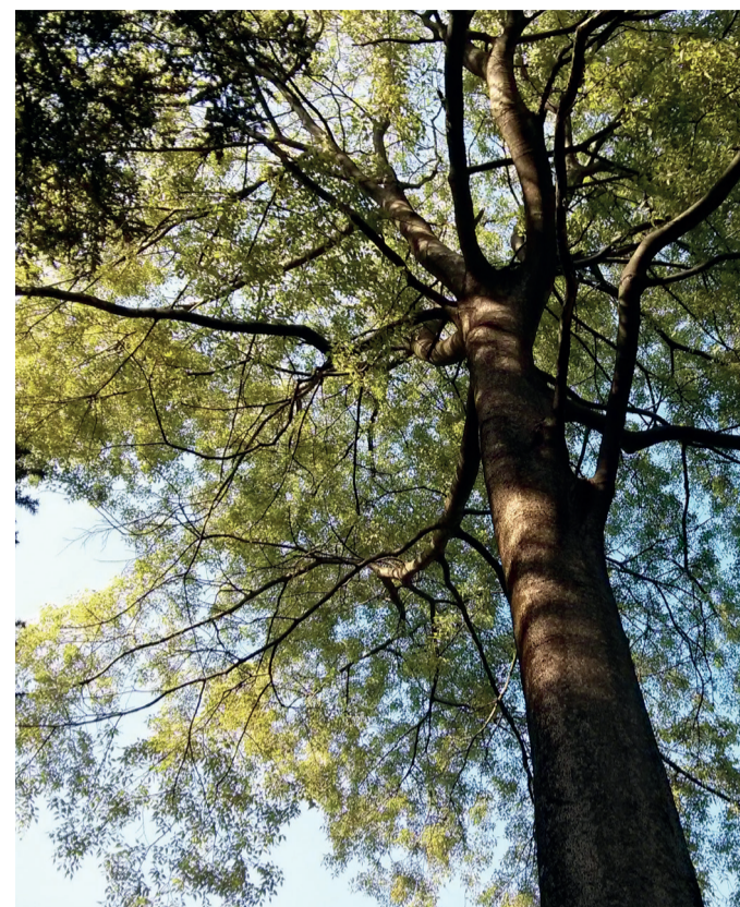
Canopy of a large plant in the botanical garden of Villa Carlotta (Como Lake, North Italy).