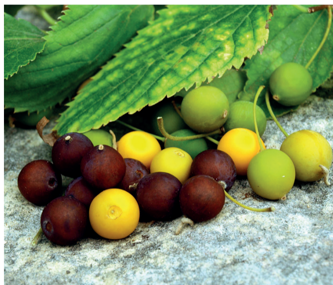
Spherical drupe fruits in different stages of maturity.

to treat liver problems (the internal part of the bark) 1 . The bark is also used to make a dye, yielding a yellow pigment. The foliage (and in some regions also the bark and thin branches) can be used as fodder for cattle 1,3,9 .