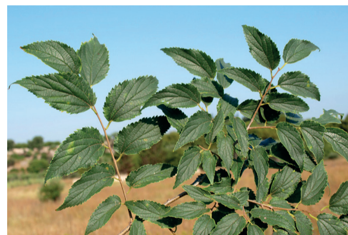
Oval-lanceolate leaves with serrated margins.