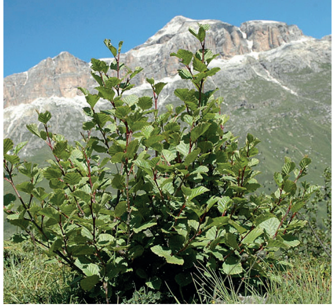
Isolated young alder in an alpine field at Col Vesco (Arabba, North-East Italy)

During the last decades, the populations of green alder in the Alps went through a considerable deterioration, mainly as a result of pest damage and fungal disease, where Cryptodiaporthe oxystoma was considered to be the primary fungus involved.