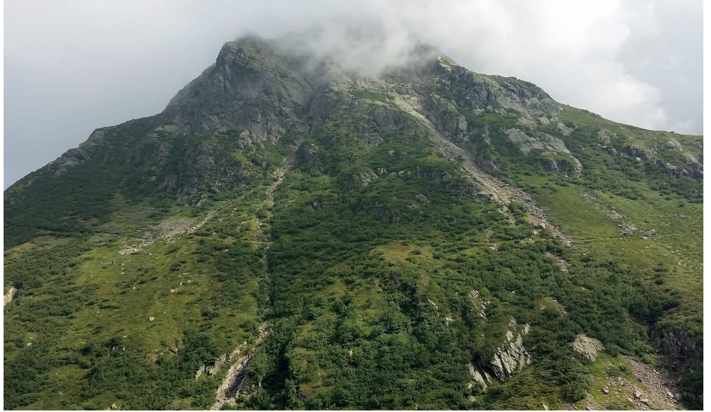
· Green alder scrub vegetation on the flanks of the Pizzo Nero (Monte Rosa Group, North Italy)