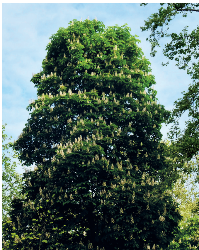
Isolated large European horse chestnut in a garden park.