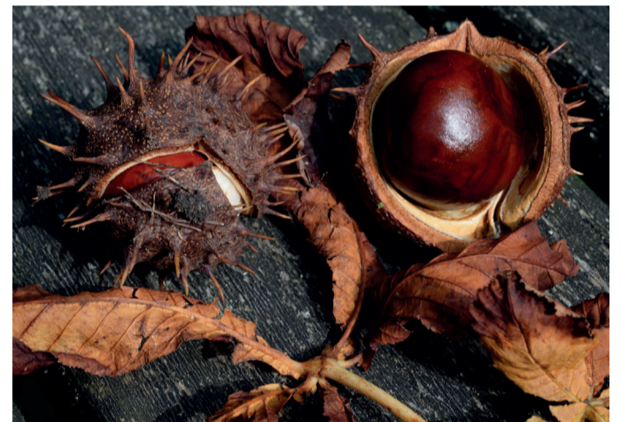
The large brown seeds are also known as conkers.