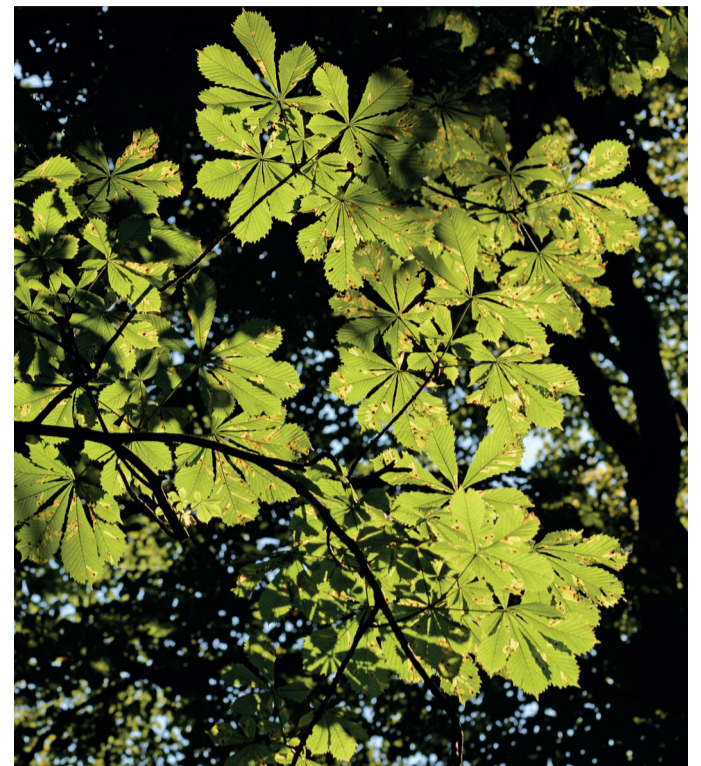
The large leaves are composed of 5-7 palmate leaflets.

Total population in the native habitat is reduced to less than 2500 mature individuals 21 , with declining subpopulations due to strong infections by Cameraria ochridella (nocturnal moth, Lepidoptera), which feeds on the leaves, causing mid-summer defoliation and exhaustion of the trees and may reduce reproduction in natural populations 22-24 . Horse-chestnuts are highly vulnerable 25 to the Asian longhorn beetle ( Anoplophora glabripennis ) which is a large wood-boring beetle native of Asian countries, such as Japan, Korea and China. Other threats are road construction, local tourism, wood extraction, pollution, and forest fires in the residual native areas. European horse-chestnut is assessed as vulnerable in Greece and Bulgaria and near-threatened at European scale 21 .