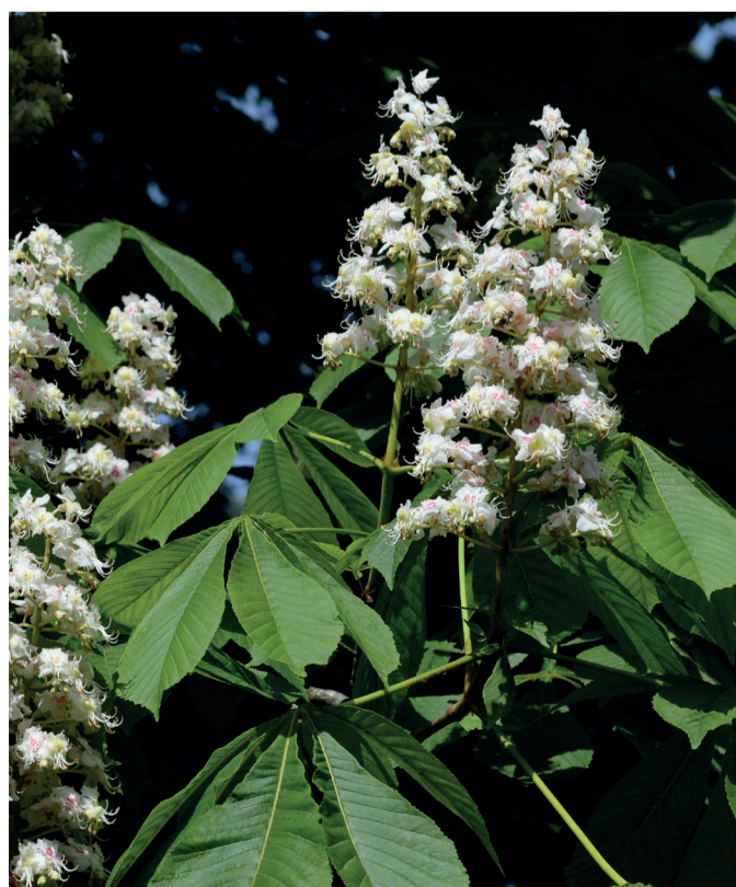
The distinctive flowers appear in spring and are pollinated by bees.