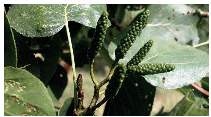
Maturing catkins during mid summer: they appear in early summer, are dormant in winter and are fully functional at the end of winter.

more frequent on plantations outside the natural area range, even if in general pathogens affecting the Italian alder are of limited importance<sup>11</sup>. Root system damage is reported by fungi Armillaria spp., Phytophtora alni and Cryphonectria parasitica11, 15-17. In northern Europe a new species of genus Phytophthora is affecting foliage and causing bark necrosis, recently also spreading in the Mediterranean region<sup>11, 18</sup>. Insect pests Cossus cossus, Zeuzera pyrina and Saperda scalaris affect the cortical zones of plants in precarious health conditions<sup>1, 11</sup>. In natural ranges actually the main threats endangering Italian alder are the reduction of clear cutting in mixed forests and in protected areas, heavy and unauthorised grazing in forests, and the isotherm shift in the Mediterranean regions. The possibly increase in temperature due to climate change may force alder ecosystems to shift to higher elevations in restricted areas5.