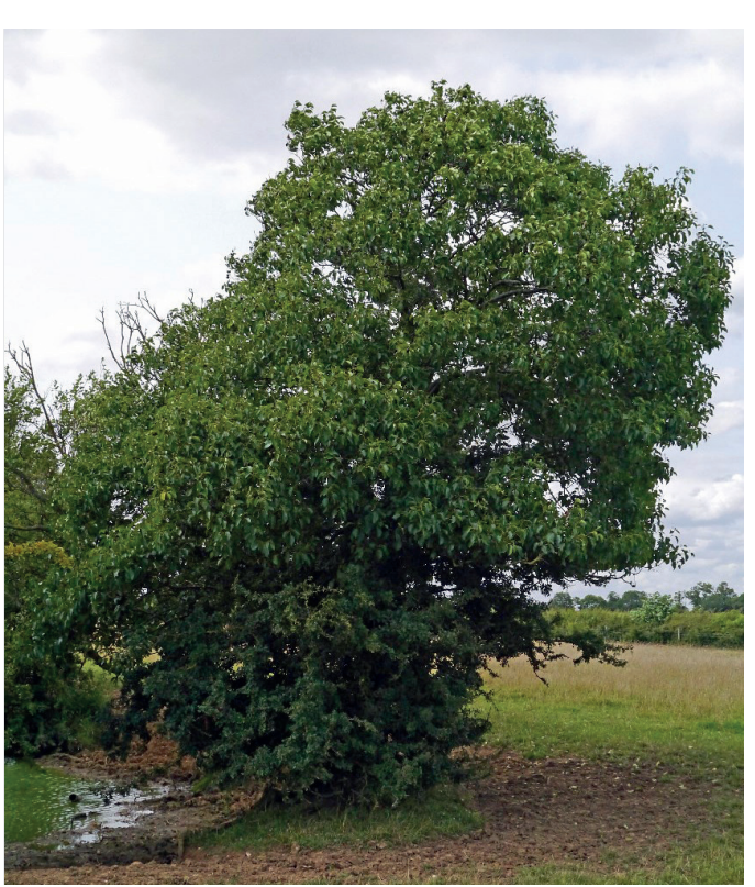
.... Italian alder in the Soar valley, Leicestershire, UK

Despite its limited natural range, Italian alder is not considered an endangered species, because it grows over a wide range of elevations and can spread very rapidly<sup>5</sup>. Diseases are