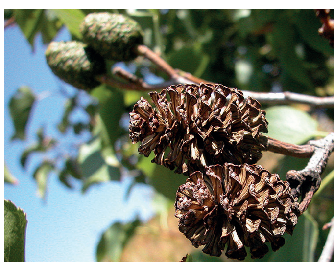
Old woody fruits (pseudo-cones) which persist on the plant while new ones are maturing.

Italian alder occurs in the Mediterranean sub-mountain and mountain belt. Unlike other alders, it is less dependent on riparian habitats and is more drought tolerant, although it still tends to concentrate in water accumulation zones and needs climates with an annual precipitation of at least 1000 mm per year<sup>13</sup>. It is a heliophilous species, but can be shade-tolerant under favourable rainfall regimes<sup>5, 11</sup>. It grows in on most kinds of soils, including degraded, but preferring calcareous. The root system promotes a symbiosis with the nitrogen-fixing bacterium Actinomyces alni (Frankia alni) improving soil fertility<sup>1, 11</sup>. In optimal habitats this alder is fast-growing and behaves as a pioneer species, forming pure stands beside Turkey oak (Quercus cerris) and beech (Fagus sylvatica) woods<sup>5, 13</sup>. It also tends to colonise open woods such as black pine ( Pinus nigra ) plantations in wetter conditions and abandoned chestnut (Castanea sativa) orchards<sup>5, 10, 13</sup>. It can be found as first-stage species in bare soils after wildfires or landslides13.