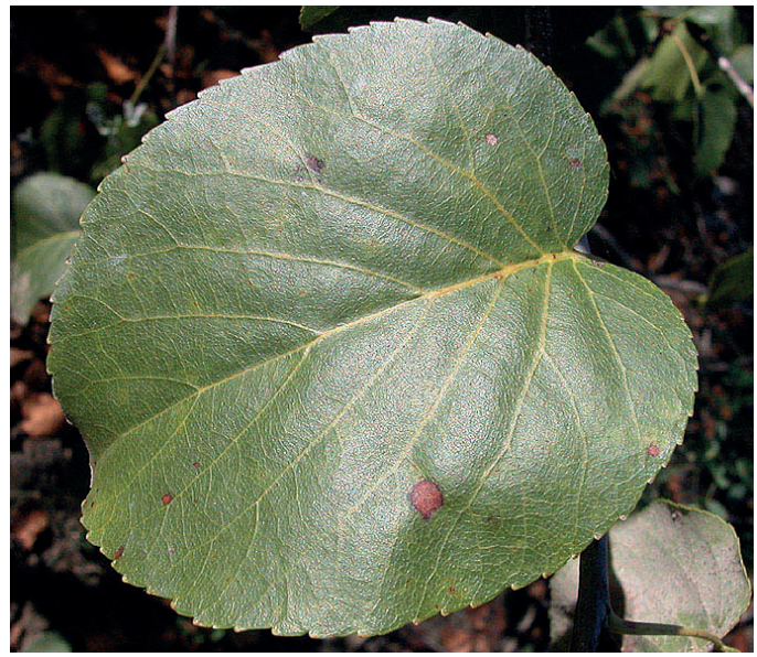
.... Dark green heart-shaped leaf with toothed margins.

more frequent on plantations outside the natural area range, even if in general pathogens affecting the Italian alder are of limited importance<sup>11</sup>. Root system damage is reported by fungi Armillaria spp., Phytophtora alni and Cryphonectria parasitica11, 15-17. In northern Europe a new species of genus Phytophthora is affecting foliage and causing bark necrosis, recently also spreading in the Mediterranean region<sup>11, 18</sup>. Insect pests Cossus cossus, Zeuzera pyrina and Saperda scalaris affect the cortical zones of plants in precarious health conditions<sup>1, 11</sup>. In natural ranges actually the main threats endangering Italian alder are the reduction of clear cutting in mixed forests and in protected areas, heavy and unauthorised grazing in forests, and the isotherm shift in the Mediterranean regions. The possibly increase in temperature due to climate change may force alder ecosystems to shift to higher elevations in restricted areas5.