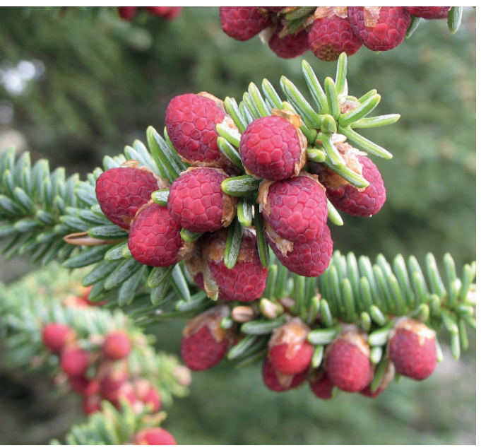
Reddish pollen cones of Spanish fir (Abies pinsapo var. pinsapo).

interest and due to the threats, endemism and geographically scattered distribution, their preservation as genetic resources is a major challenge. Diverse genetic conservation strategies have been elaborated, complementing the protection of natural stands (national or local parks and reserve) with the conservation of genetic resources outside their natural habitats (plantations, orchards and conservation of genetic material in vitro and with cryopreservation<sup>30, 31</sup>). Southern fir populations deserve special attention under global warming conditions, particularly in regard to their genetic characters, which may be relevant for future adaptation processes of firs<sup>30</sup>.