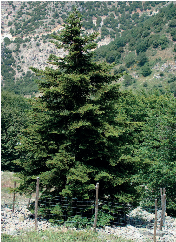
. The total Sicilian fir (Abies nebrodensis) population counts 24 mature trees which are protected by fences

accidental fires represent the major cause of forest loss. Firs are particularly sensitive to excessive (anthropogenic) fire disturbance, which is pervasive in most Mediterranean areas. When severe, wild fires can destroy entire stands and degrade the habitat, making it less suitable for firs, so that post-fire regeneration is not always guaranteed<sup>12, 16, 34-37</sup>. Goat and cattle grazing activity can be particularly destructive when intensive, damaging seedlings and young shoots of juvenile plants and limiting forest regeneration. Now in most fir forests pasturing continues under control, but in some isolated A. cilicica stands livestock grazing is still one of the main threats<sup>13, 18, 33</sup>. Forests degraded by fire and grazing activity are more susceptible to pathogens. A. pinsapo has seen an increase in attacks of the root rot fungus Heterobasidion spp. and the coleopteran Cryphalus numidicus in recent decades, especially in drought periods<sup>34, 38, 39</sup>.